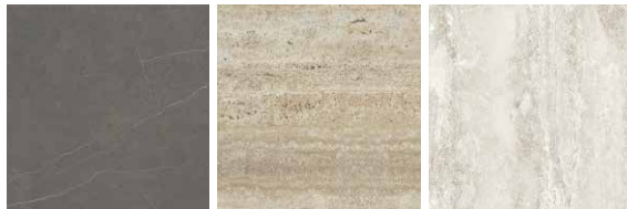
Dark Grey Travertine Beige Travertine Silver