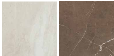
Bone Pulpis Brown